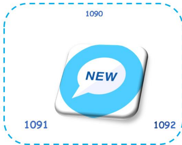
(Figure: 2) IAG Parameters 1090, 1091 & 1092.